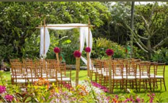
MOIR GARDEN, WEDDING CEREMONY SITE